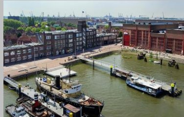
Rotterdam office (RDM) Heijplaatstraat 23, Rotterdam