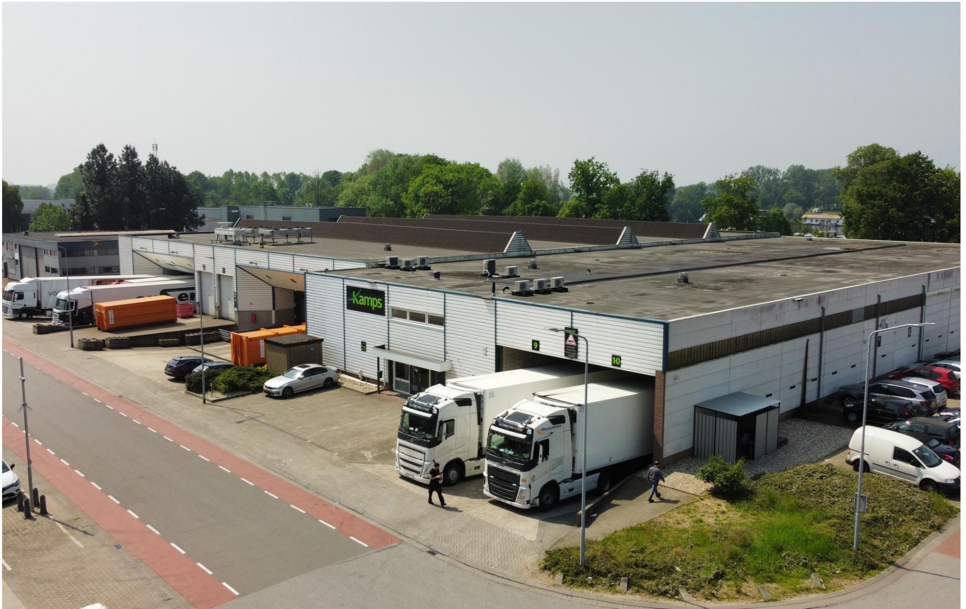
HAVENLAAN 25, KATWIJK AAN DE MAAS (CUIJK)