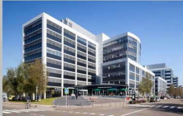
Amsterdam office (the Base) Evert van de Beekstraat 104 Amsterdam Schiphol-Airport