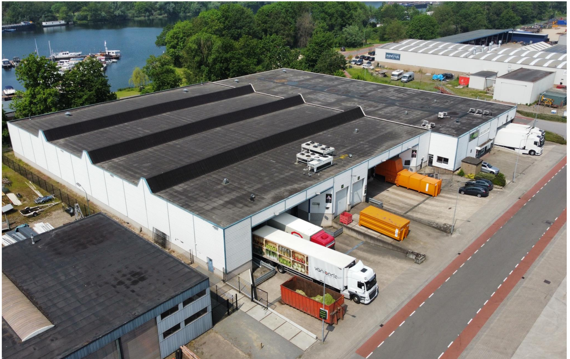
HAVENLAAN 25, KATWIJK AAN DE MAAS (CUIJK)