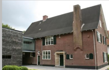
Tilburg office Ringbaan West 242, Tilburg

"INDUSTRIAL REAL ESTATE PARTNERS, THE NATIONWIDE SPECIALIST IN THE FIELD OF LOGISTICS AND INDUSTRIAL REAL ESTATE, IS COMMITTED TO CONTRIBUTE TO THE TRANSPARENCY OF THIS NICHE MARKET."